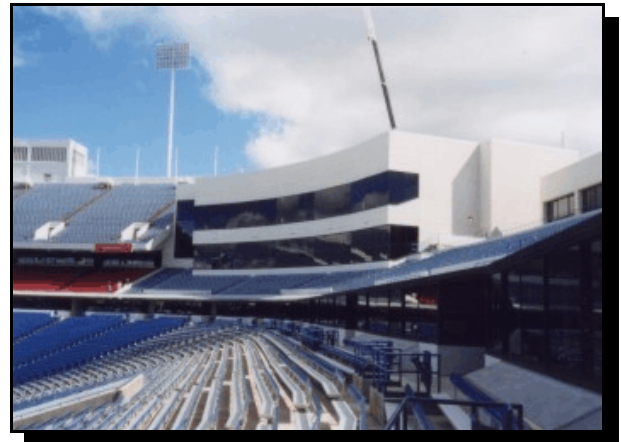
End Zone Club Suite