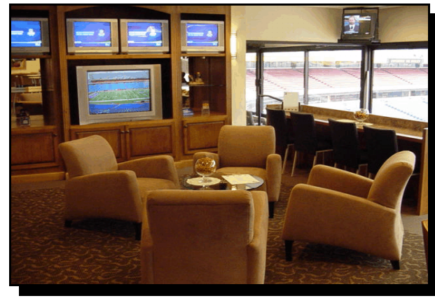
Bills Marketing Dept. Mega-Suite