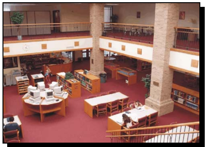
New Library & Media Center